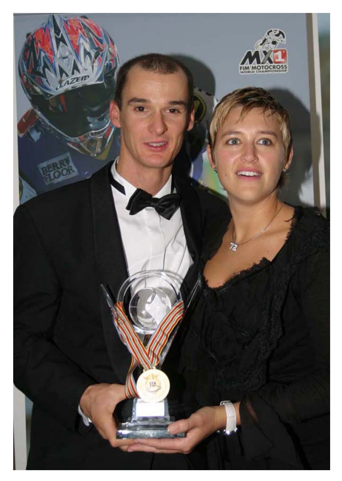
For the first time since many years a main "outside" sponsor is involved in the GP's: Karcher. It's another step for Motocross?

It's great. When an outside sponsor comes it means that we have opened a door - for us as well as teams and riders.... it means that they have interest in our sport, and that we must continue to work in this direction.