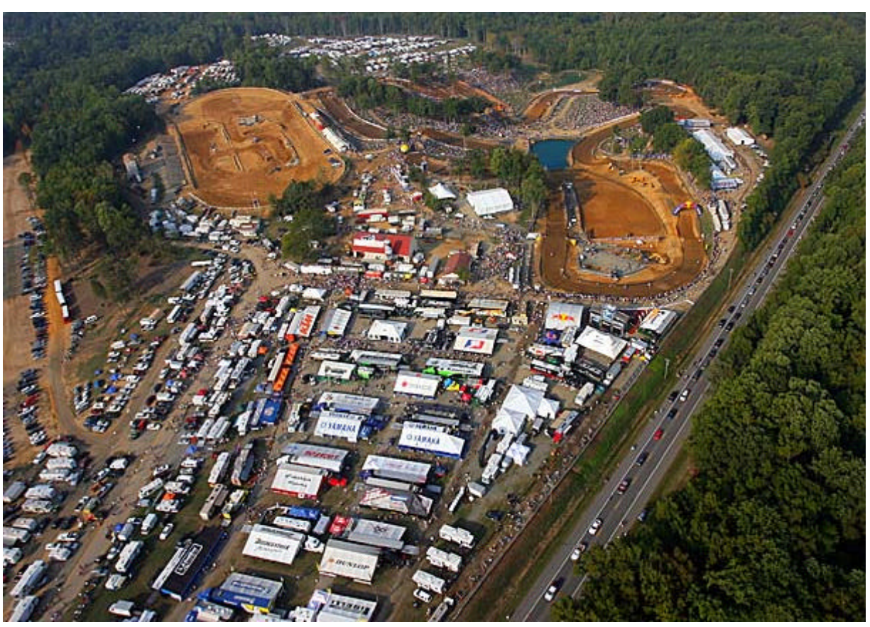
The track from a "high" point of view

The Red Bull FIM Motocross of Nations will be: